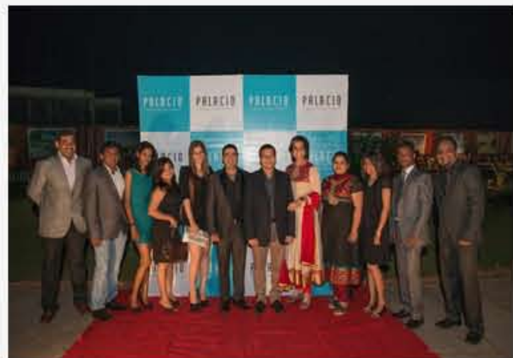
TEAM EFFORT - The Palacio Group team threw a sumptuous Christmas party